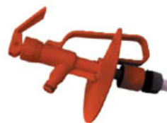
Remote discharge nozzle